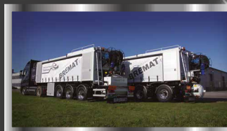
We are ready to help you with the best machines and optimal service!

Furthermore BreMAT delivers customer specified solutions for the mixing and pumping of several types of mortar, including EPS insulation mortar, foam mortar and PUR-materials.