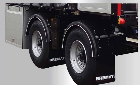
The 2-axle semitrailer complies to the most recent safety and quality standards.