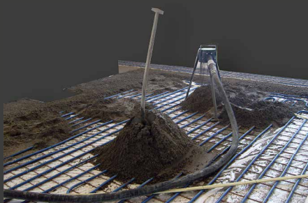
Sand, cement, water and additives are fully automatically mixed and transported to the workplace.

Beside cost savings and a guaranteed high-quality mortar production, the installation takes care of a significant improvement of the working conditions.