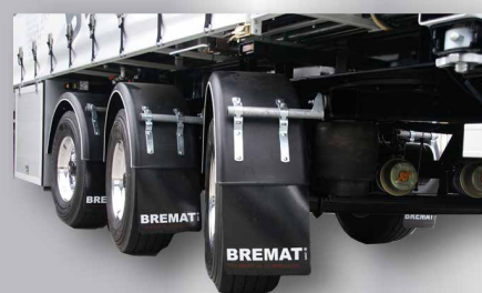
The 3-axle semitrailer complies to the most recent safety and quality standards and has a European Type Approval.