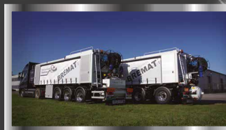
We are ready to help you with the best machines and optimal service!

Furthermore BreMAT delivers customer specified solutions for the mixing and pumping of several types of mortar, including EPS insulation mortar, foam mortar and PUR-materials.