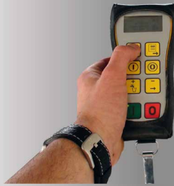
The installation can be controlled from the job site with the radiographic remote control.