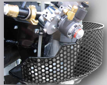
Glass fibre, liquid, viscous and powder additives can all be measured and dosed automatically.