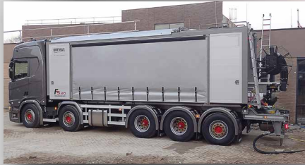
Machines from the BreMAT F-series can also be mounted on a truck chassis.