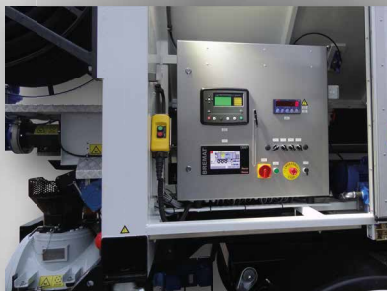
The computercontrolled system is easy to operate from the advanced touchscreen display.