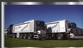
We are ready to help you with the best machines and optimal service!

Furthermore BreMAT delivers customer specified solutions for the mixing and pumping of several types of mortar, including EPS insulation mortar, foam mortar and PUR-materials.