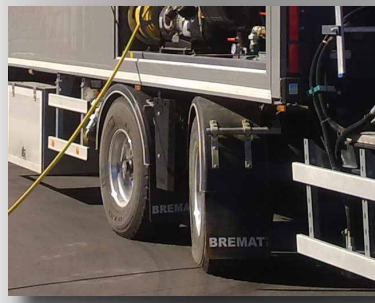
For optimal driving characteristics the 2-axle semitrailer is standard equipped with a rod-steered steering axle.