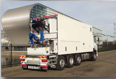
Installations from the BreMAT P-series can also be mounted on a truck chassis.