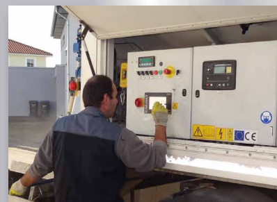
The computer controlled system can be easily operated from the highly advanced touchscreen display.