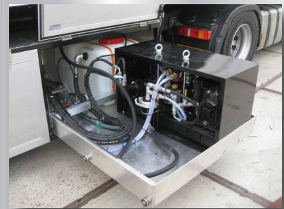
The FE version can be equipped with a foam generator so the installation is suitable for producing foam mortar.