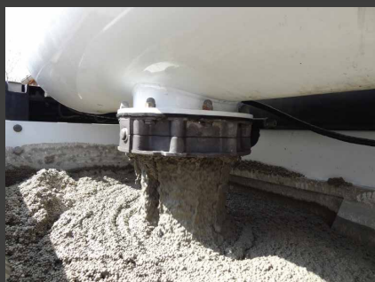
The FE version can produce and pump viscous EPS-mortar.

Due to the self-reliant management of material transport, the purchase of raw materials and the automatic filling of the mixer, the material and labor costs are considerably lower. The installation also takes care of a significant improvement of the working conditions.