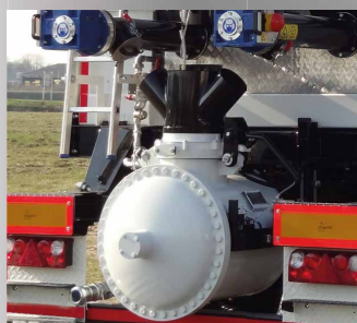
The ZE version can produce and pump semidry EPS-mortar.