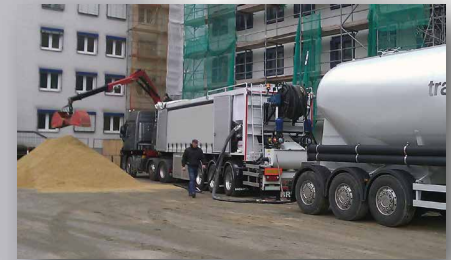
Because of the horizontal production system, the installation can be reloaded during the production process