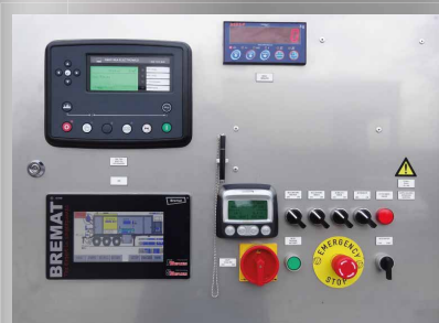
The computer controlled system is equipped with an advanced touchscreen display and is easy to operate.