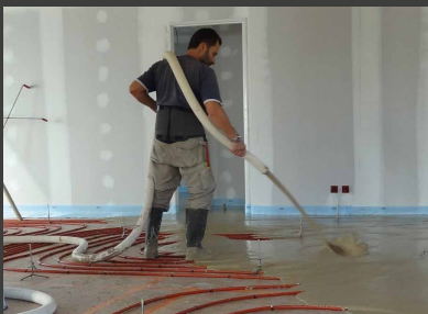
Precise material dosage allows the production of homogeneous and high-quality self levelling floor screeds.

The independent transport of materials, the purchase of basic raw materials in bulk and the fully automatic supply to the mixer, all contribute to considerable savings in material and labour costs. The S-series also provides a noticeable improvement in working conditions.