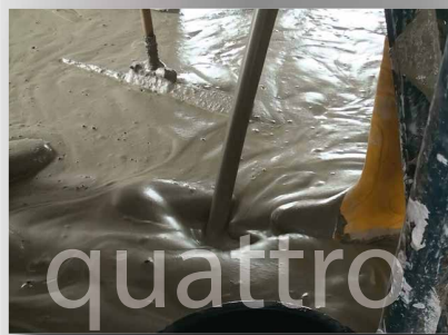
The Quattro version of the S3.17 XL has a foam-generator that can produce foam and inject it into the liquid mortar for producing foam mortar.