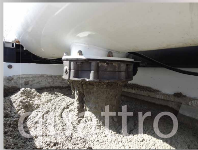
The Breemat S3.17 XL Quattro can also be used for the production of a high-quality viscous EPS mortar.