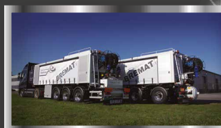
We are ready to help you with the best machines and optimal service!

Furthermore Breemat delivers customer specified solutions for the mixing and pumping of several types of mortar, including EPS insulation mortar, foam mortar and PUR-materials.