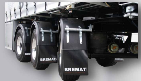
The triple axle trailer chassis complies with the most recent safety and quality requirements and carries a European Type Approval.