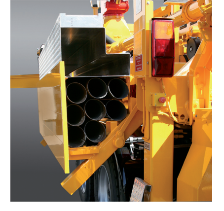
The hydraulic hose box can be lowered without outriggers down and putting the hoses within easy reach of the operator.

In the working position the extended cylinders are on the top of the boom. This protects them from collision and concrete spills. In the working position the extended cylinders are on the top of the boom. This protects them from collision and concrete spills.