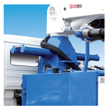
2 slewing cylinders on each side of the turret guarantee safe and dependable operation.