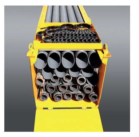
The hose boxes can be customized. The plastic sleeves are angled to allow residual concrete to run off.