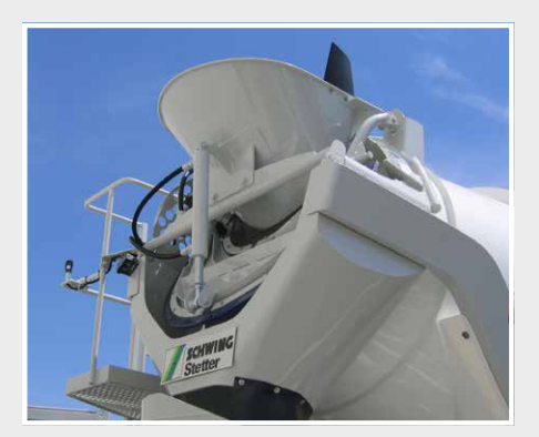
Drum cover (3/4 or full lock)