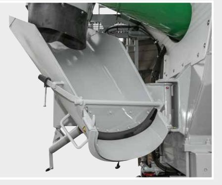
Retainer flap swivel chute