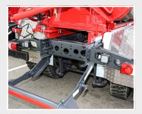
LED auxiliary headlights at the rear (2 pieces)