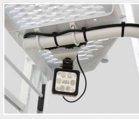
LED work lights below the ladder pedestal