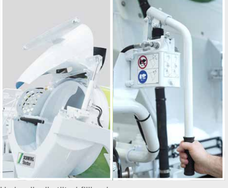
Hydraulically tilted filling hopper (allows high pressure cleaning of the mixing drum)