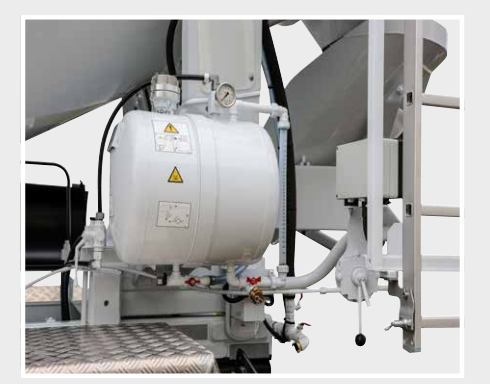
Plasticiser system 60 I (compressed air)