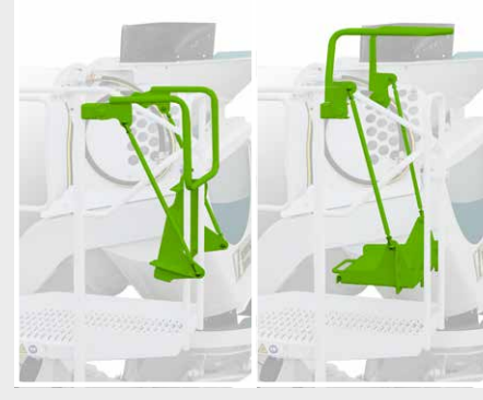
Ladder platform with step and railing elevation