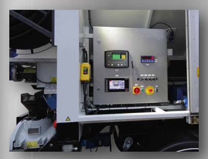
The computercontrolled system is easy to operate from the advanced touchscreen display.