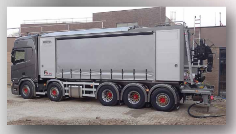
The Bremat F4.15 consists of a 4-axle truck chassis and the F5.17 is assembled on a 5-axle truck chassis.