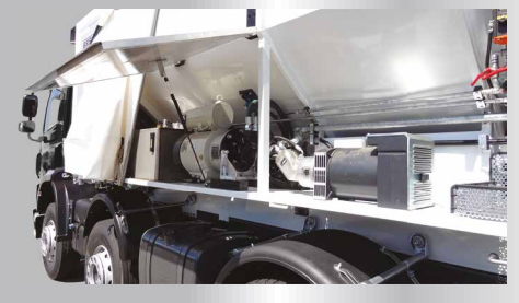
Cost- and space-saving: instead of a diesel unit, the machine is being driven by the diesel engine of the truck, through a PTO.