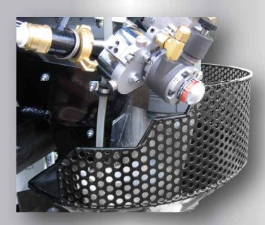
The Bremat F-series can be reloaded, without interrupting the production process.