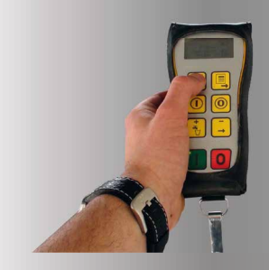
The installation can be controlled from the job site with the radiographic remote control